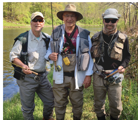
Three doctors enjoying a day fishing in the Catskills