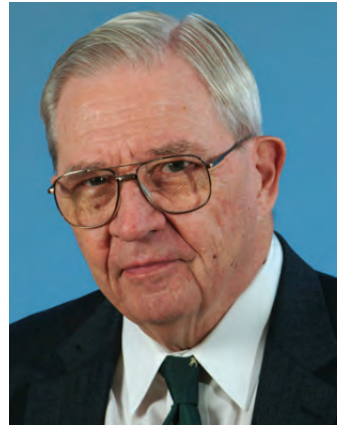
Donald A. (DA) Henderson, M.D.